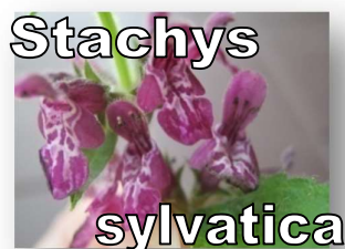
Module 3: Taxonomy