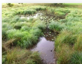
Module 4: Habitats and Habitat Indicators

❶ Please note that this course does not cover grasses, rushes or sedges. These will be covered in a separate course.