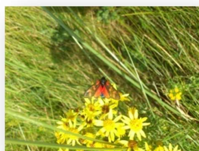
Module 1: Plant Science