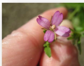
Module 2: Plant Identification